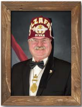
Alzafar Shrine 2025 Potentate Elect